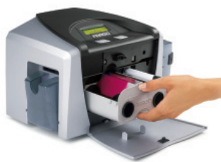
DTC400e single-sided printer

Designed for easy operation and hassle-free maintenance. The Fargo DTC400e features an all-in-one ribbon cartridge that combines a printer ribbon and card cleaning roller into one convenient unit. Just slide in the cartridge, close the door, and you're done. No feeding or tearing ribbon rolls, no fumbling with separate cleaning rollers. The integrated cartridge ensures that you'll change the cleaning roller with every ribbon change — a critical step to ensuring high-quality printing of conventional and rewritable cards.